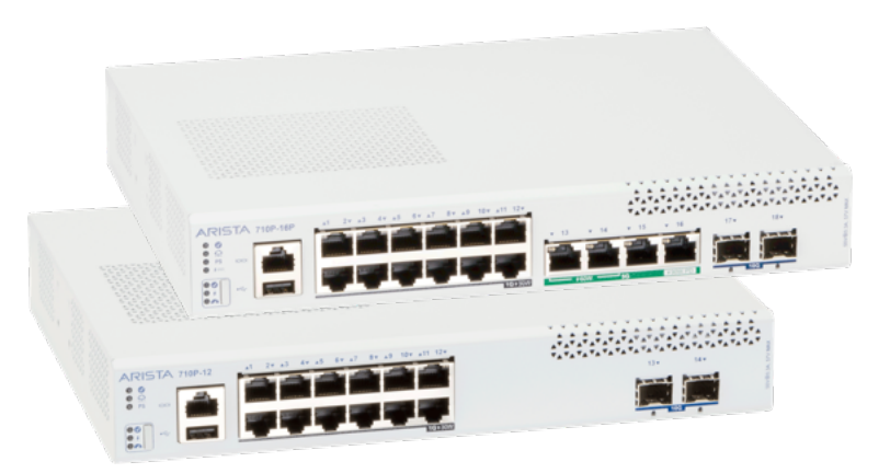
Arista 710P Series PoE Switches

The Arista CCS-710 fanless compact power over ethernet switch series was designed to extend the Cognitive Campus network into space-constrained and quiet environments such as conference rooms, retail showrooms, broadcast control rooms and small enclosures like ATMs. With multiple mounting options, the CCS-710 series switches are well suited for any deployment where sound and space are as important as reliable network operations.